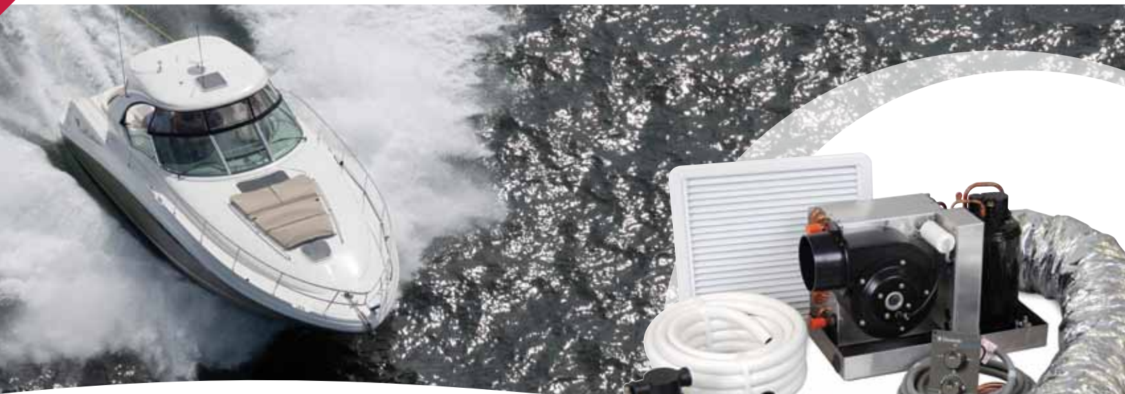
Dometic EnviroCool 5,000 BTU/hr Kit

Enjoy ideal temperatures in your boating environment with Dometic's EnviroCool marine air conditioning systems. We offer a wide range of BTU capacities from 5,000 to 15,000 BTU/hr to allow you to size your system for ultimate cooling. The EnviroCool series uses R-417A refrigerant, an environmentally safe green gas.